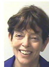
Shanna H. Swan, PhD Professor, Environmental Medicine and Public Health

early markers of disruption of normal brain growth. We propose to obtain early measures of prenatal exposure to phthalate plasticizers and APAP and examine these in relation to ultrasound trajectories of the fetal brain. We will pilot this study in a pregnancy cohort, enrolling n=250 by gestational week 10, at Maternal Fetal Medicine Associates (MFMA) – a large Upper East Side research-oriented private obstetric practice. We will obtain repeat urine samples and weekly maternal SMS reports on APAP dose and indication. Biospecimens will be banked for future analysis and all anthropometric measures will be abstracted from MFMA's delivery records. This pilot study will demonstrate the feasibility of; 1) recruitment of MFMA moms by pregnancy week 10 and retention through delivery at MSHS; 2) early collection of urinary biomarkers and frequent SMS messaging; 3) longitudinal modeling of fetal brain parameters from repeated ultrasounds at weeks 12, 16, 20 and 24-28 weeks using generalized additive mixed models; 4) epidemiologic analysis of environmental exposures in relation to fetal brain growth trajectories. These pilot results will be used to support an application in response to PA-16-311 (Safety and Outcome Measures of Pain Medications Used in Children and Pregnant Women [R01 from NICHD]).